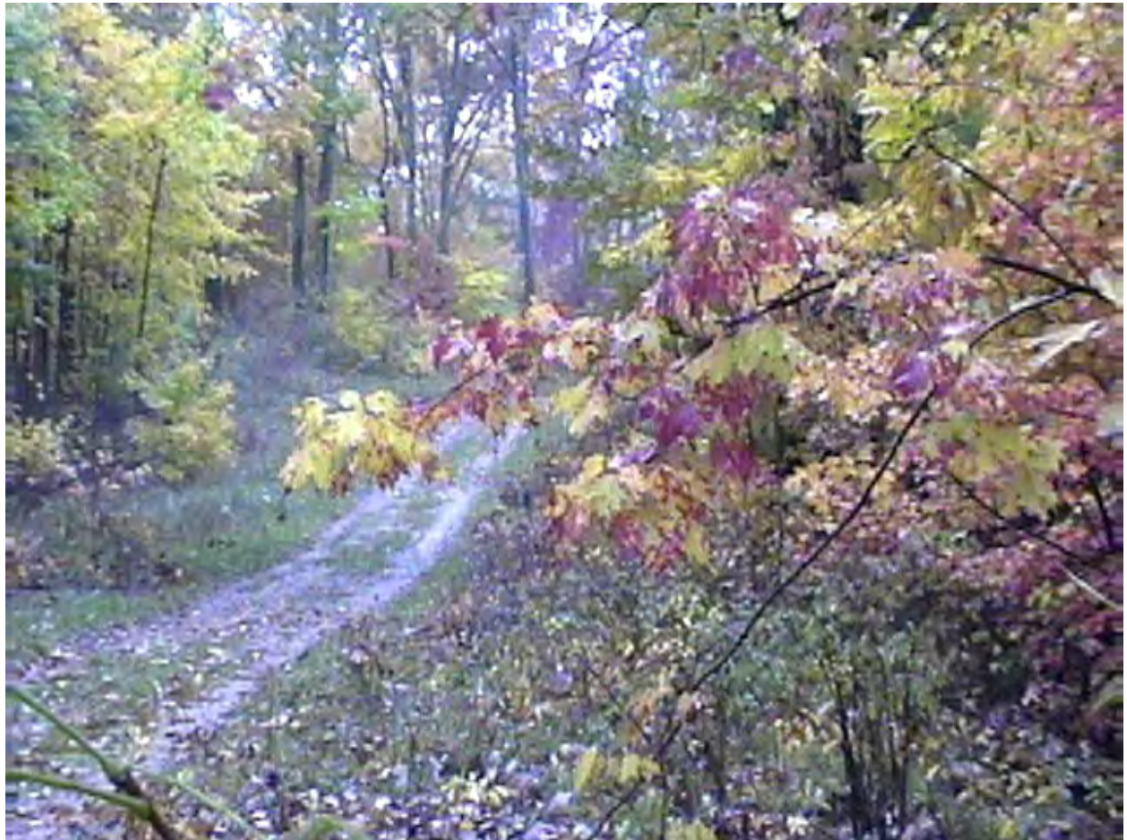
“Old Trail” at Beckley WV

We left Hervey's (some call it Beckley) and the New River to come down Coal River. We went down Mossey Creek (it used to be called Toney Creek, because it was where they camped one of