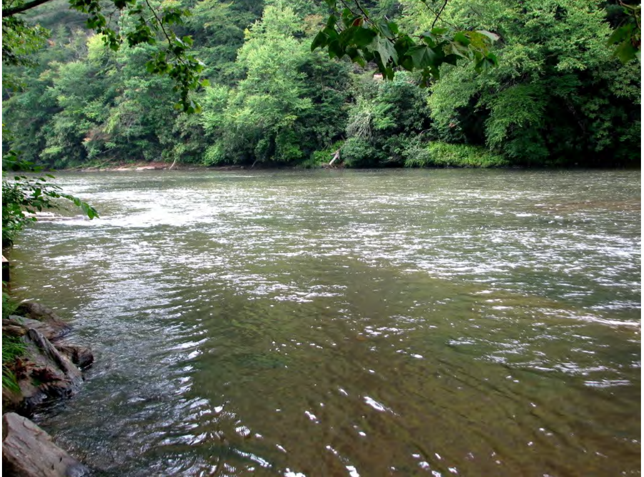
The New River

frequently and has most of the worst places leveled out. The road wound down the mountain along a stream, that kept getting bigger and wetter all the time. We stayed up from the banks of the stream, and only a few times had to ford it. We only had a couple bad places on the road. Several of us girls helped with the smaller children. They get so tired if they have to stay in the wagon all the time, well, we do too, so it was nice to be able to get out and play a little.