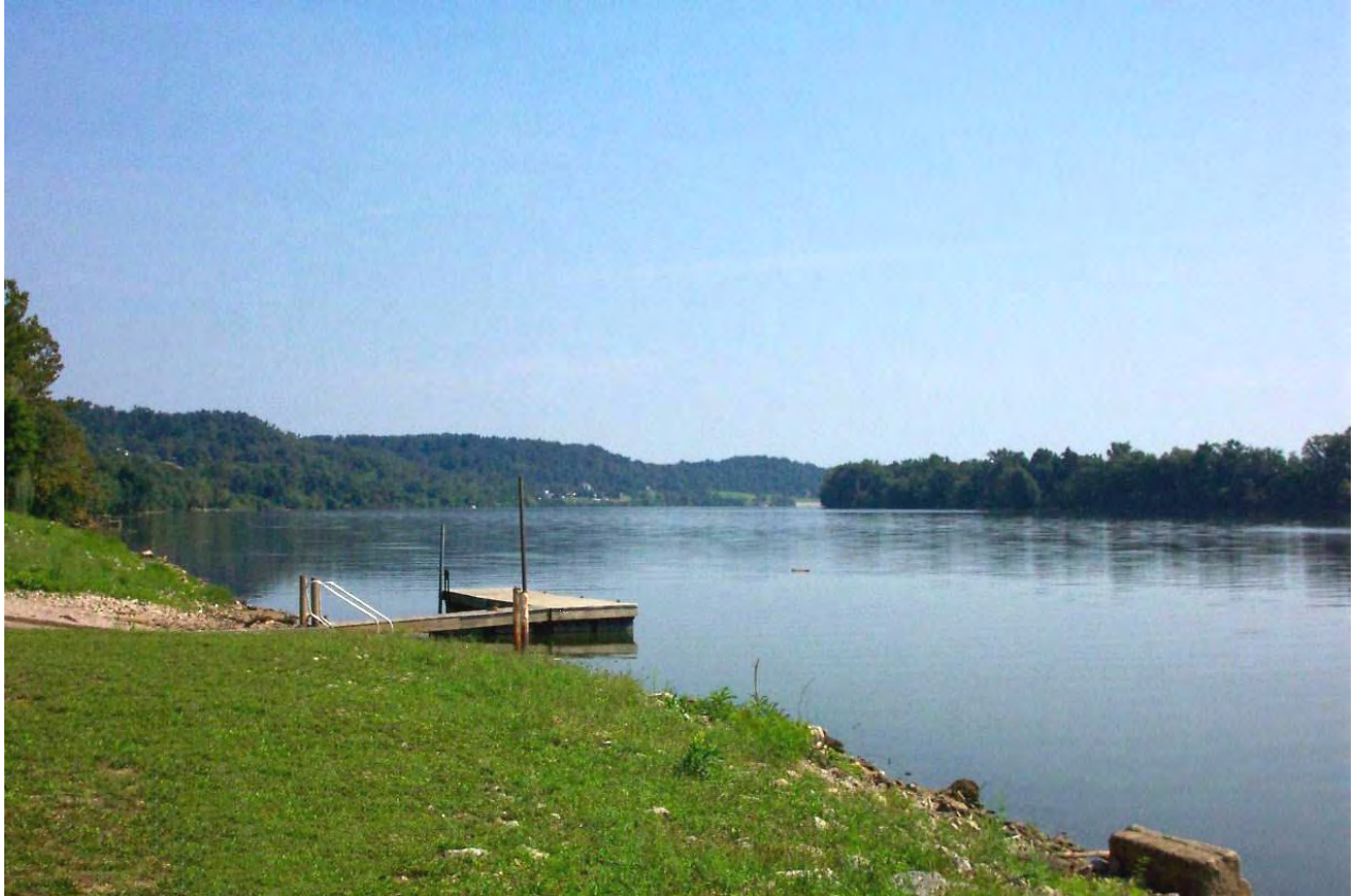
Ohio River – at Gallipolis

how they speak and dress, people are people. God made us all. That would be true of these French, here in Gallipolis, and even the Indians, here in Ohio, and the ones over in Indiana Territory, too.