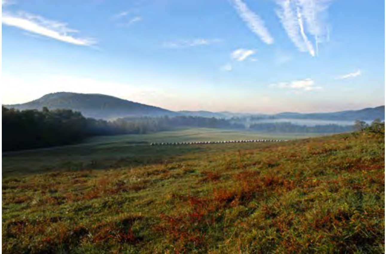
Adney Gap on the Blue Ridge Mts – Cahas Mt in distance