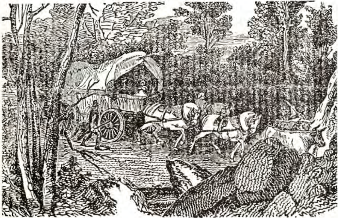
early picture – Brethren Travel