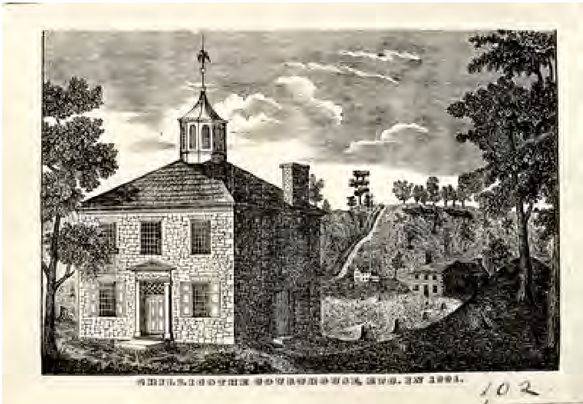
Original Capitol Building – at Chillicothe OH

The second day after leaving Woods, we came to a stream where the very water tasted of salt. Salt was actually dry beside the stream. We stopped long enough to collect several buckets of dry salt. Salt is important to keeping meat, and it makes many things taste better