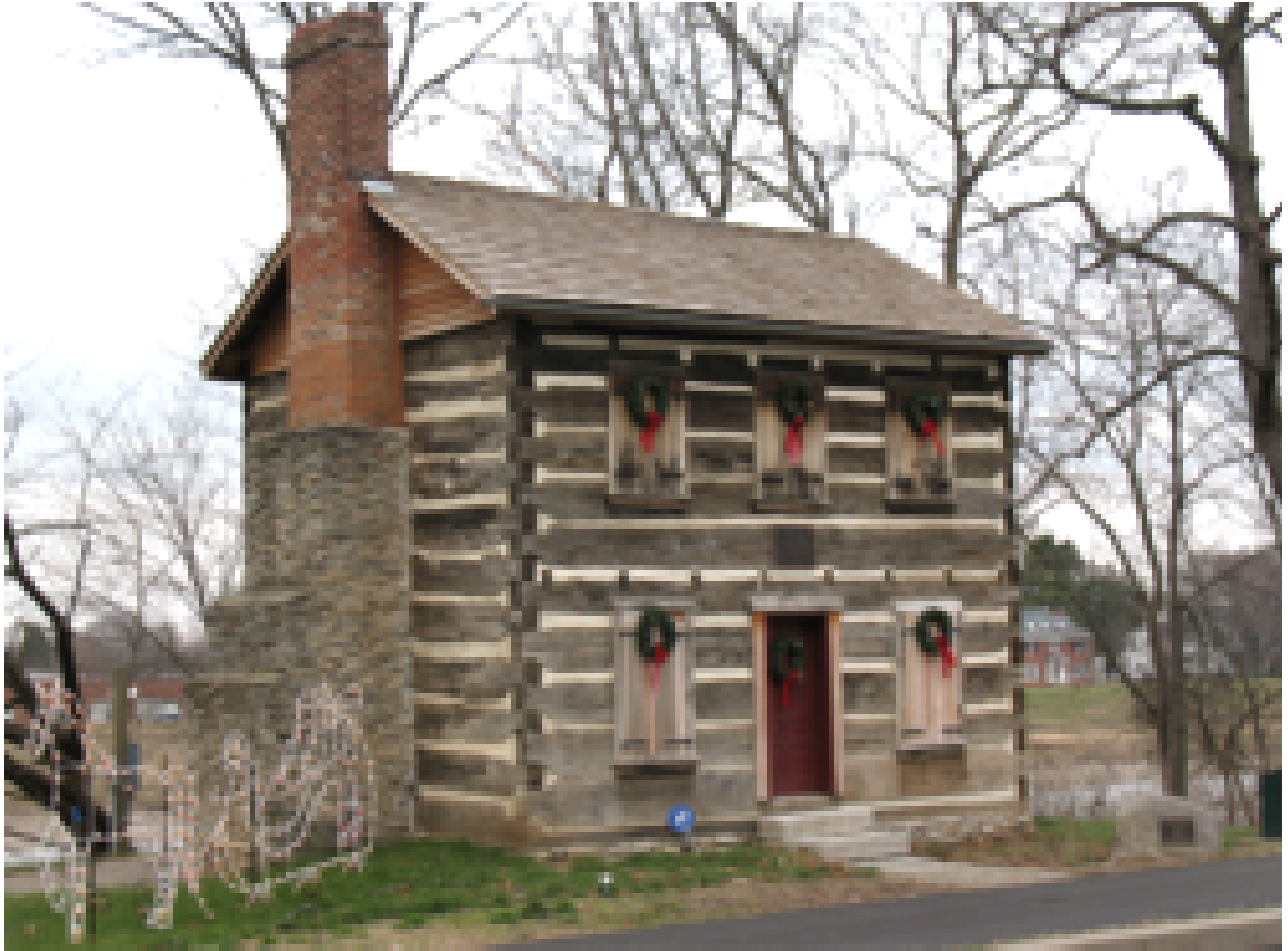
Post Office Building – Franklin OH – on Great Miami River