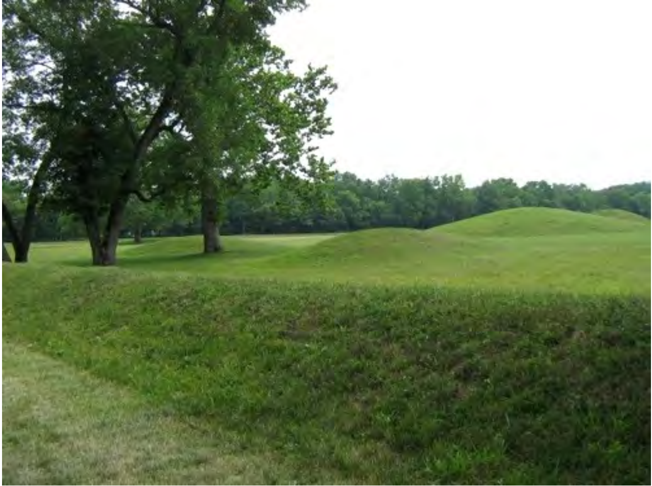
Mound City – Chillicothe OH